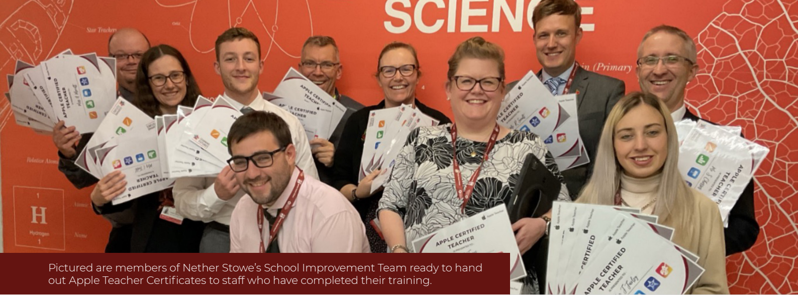
Pictured are members of Nether Stowe's School Improvement Team ready to hand out Apple Teacher Certificates to staff who have completed their training.