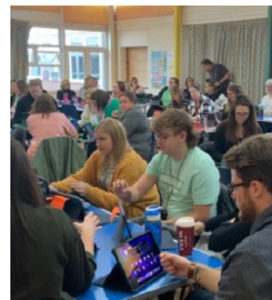
Staff at Coton Green and Brookvale discovering the potential of Apple Classroom.