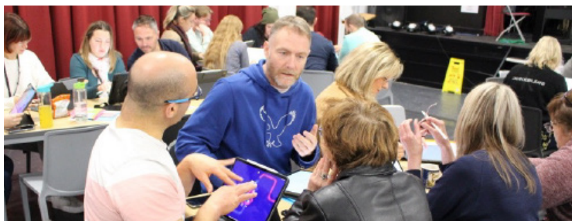
Teachers at Arthur Terry School discussing the many possibilities of iPad to enhance teaching and learning.