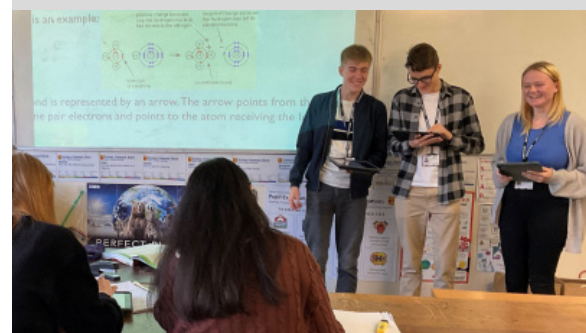
Nether Stowe School 6th formers successfully using their iPads. The Year 12 budding chemists used the Airplay in the Classroom app to collaborate on a presentation to share with their class.

We look forward to expanding our Phase 1 pilots to a selection of Arthur Terry and Coleshill 6th form students as well as trialling the use of iPad to enhance modern foreign languages (MFL) provision.