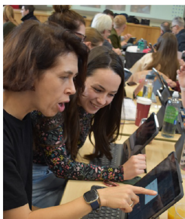
Coleshill School staff exploring the built-in accessibility features on iPad.