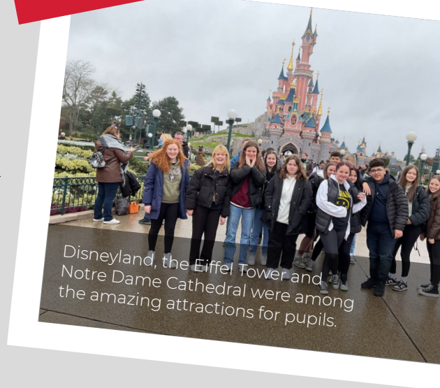
Disneyland, the Eiffel Tower and Notre Dame Cathedral were among the amazing attractions for pupils.