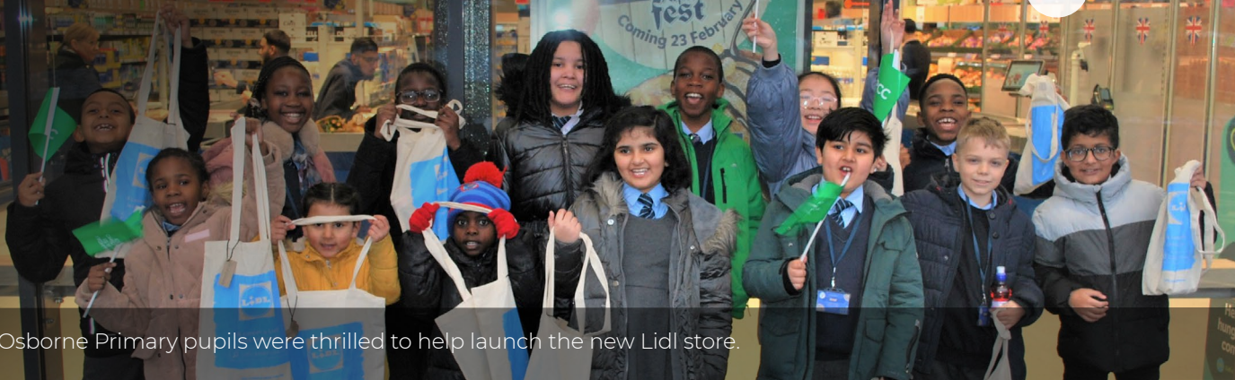
Osborne Primary pupils were thrilled to help launch the new Lidl store.

Youngsters from Osborne Primary School got the VIP treatment when they helped unveil a new supermarket in their neighbourhood.