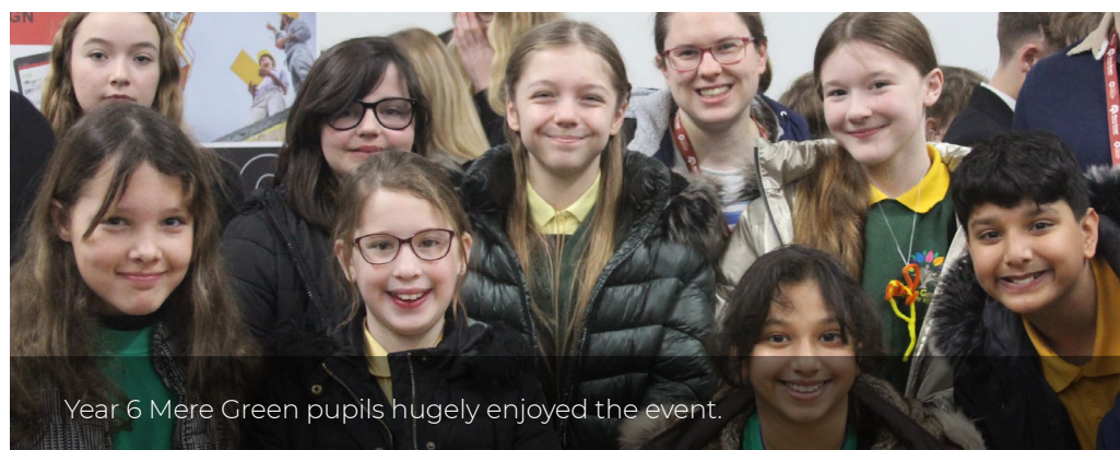
Year 6 Mere Green pupils hugely enjoyed the event.