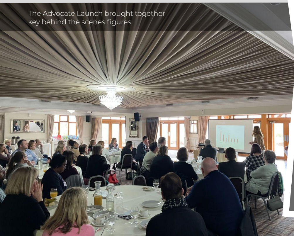
The Advocate Launch brought together key behind the scenes figures.