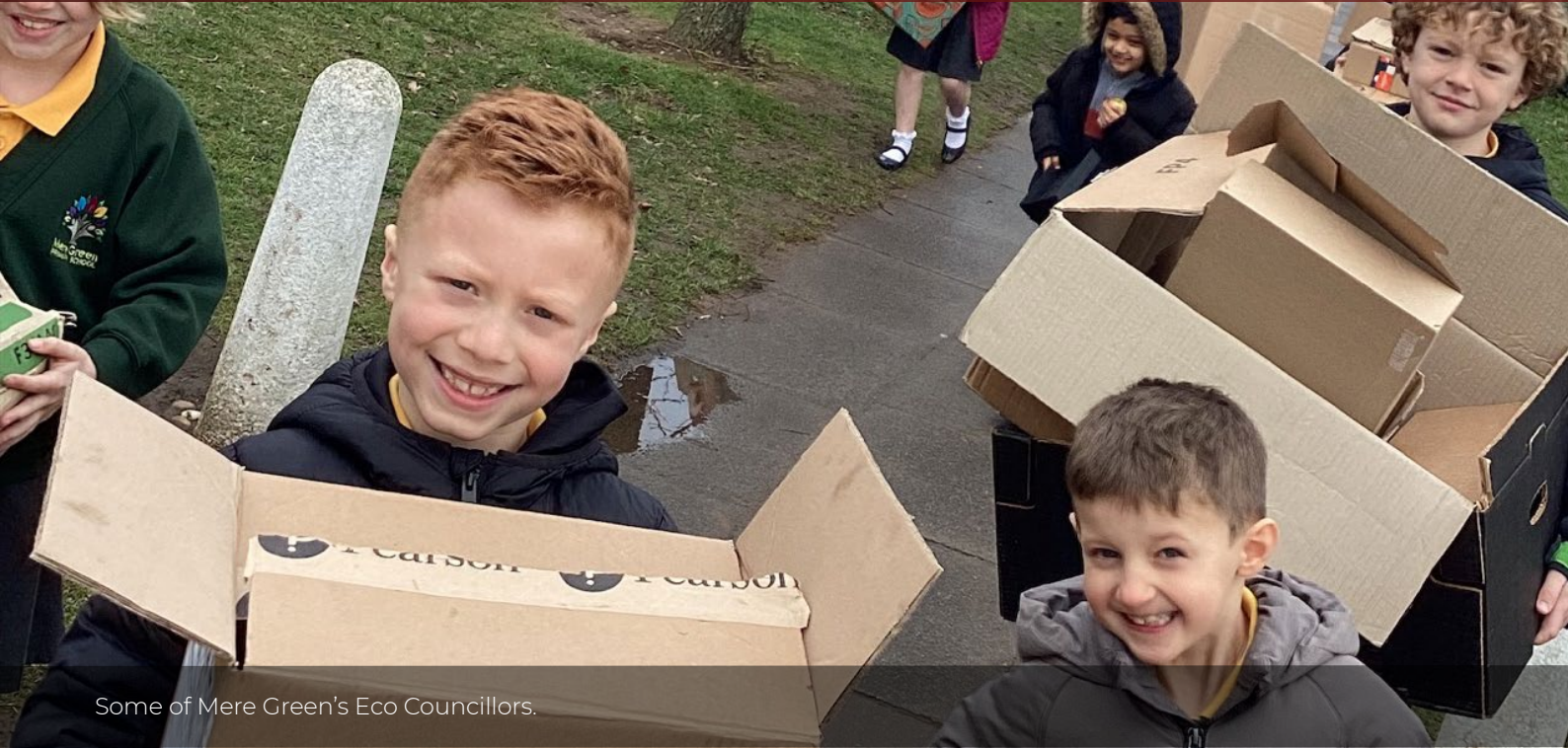
Some of Mere Green's Eco Councillors.

A dozen committed Mere Green Primary pupils have a busy time in store as they continue their great work as Eco Councillors.