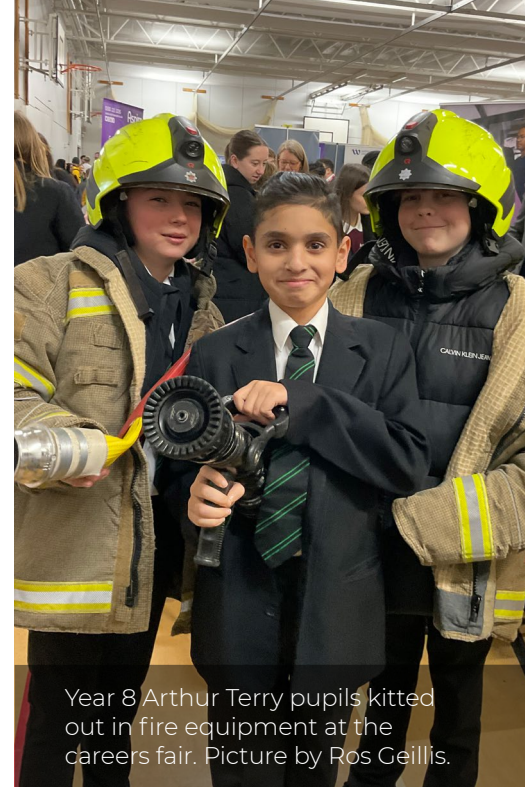
Year 8 Arthur Terry pupils kitted out in fire equipment at the careers fair.

Baroness Morgan's visit was arranged by Birmingham Careers Hub, which is funded by the CEC and delivers careers support to more than 100 schools across the Second City.