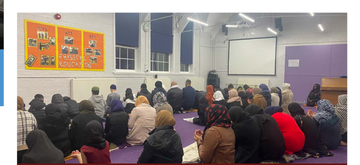
The Iftar brought many members of the community together.