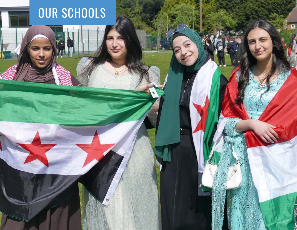
Culture Day promotes understanding and respect for different traditions.