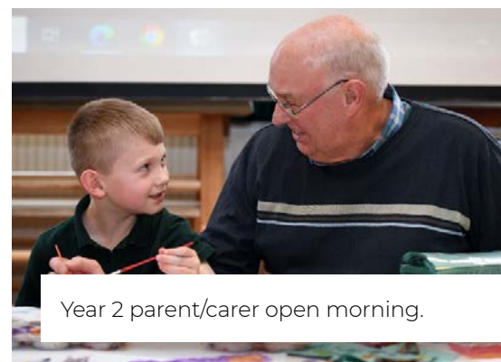
Year 2 parent/carer open morning.

"However, it is not the accolades, nor the prospect of a brand-new net-zero, sustainable school that make Hill West a special place to learn and play; rather it is the emphasis we place on ensuring our children are loved, cared for and supported to belong and succeed through our purposeful consideration of deep, trusting relationships with all adults."