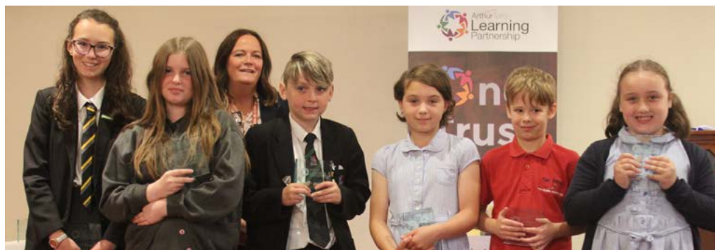
Charity Fundraiser winners.