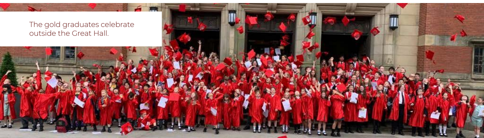
The gold graduates celebrate outside the Great Hall.

"It enabled me to take part in school productions, Duke of Edinburgh Award, STEM club, trips abroad and perform at the German Market, among lots of other things. Academics are important, but school is about so much more than that."