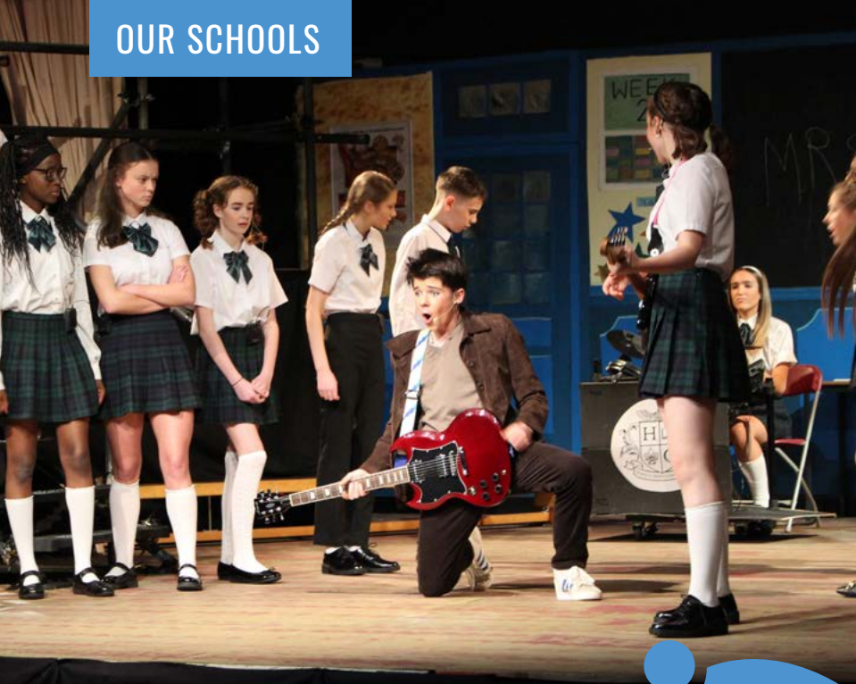
School of Rock was a big hit.