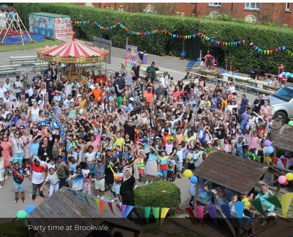
Party time at Brookvale.