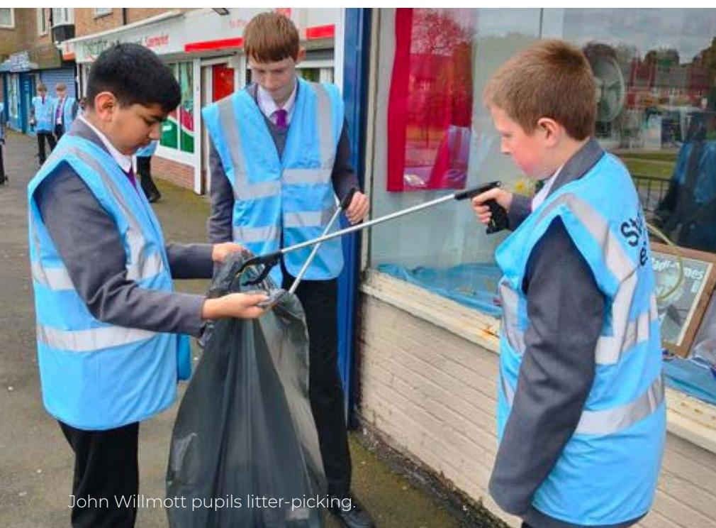
John Willmott pupils litter-picking.

The popular Year 1 pupil has been recognised as a 'Rising Superstar' and won his accolade in the 'Academics' category.