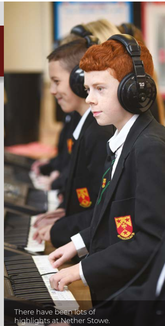
There have been lots of highlights at Nether Stowe.

"These developments go hand-in-hand with our revised ethos and values of be respectful, be ambitious and be resilient, which will shape our school community over the coming months and years."