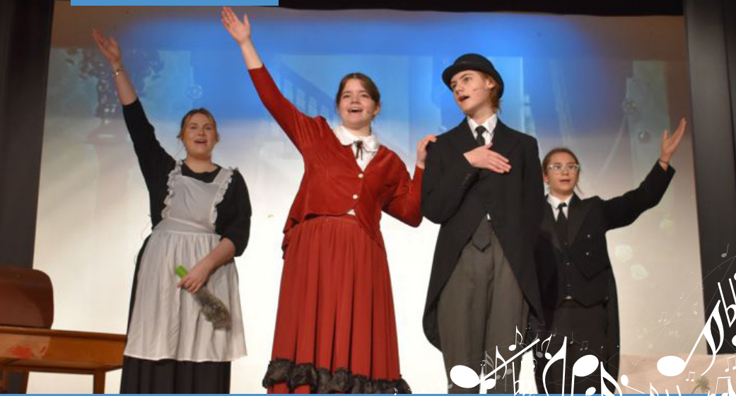
The Mary Poppins shows wowed audiences.