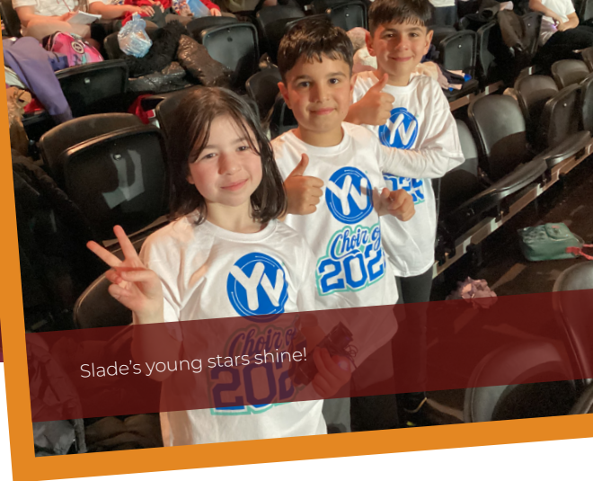
Slade's young stars shine!