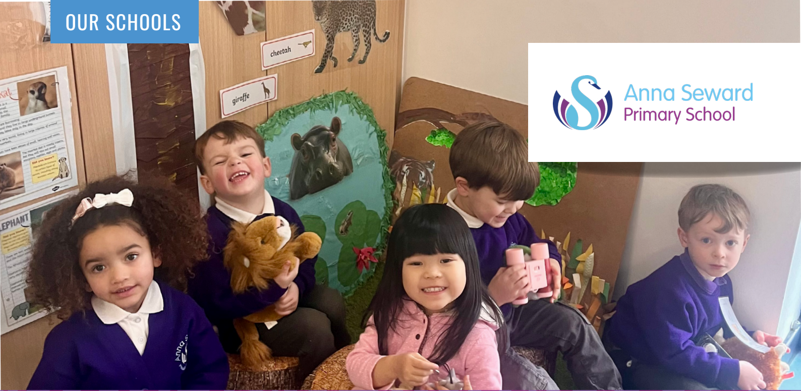
Anna Seward Nursery pupils are relishing their latest exciting role play.