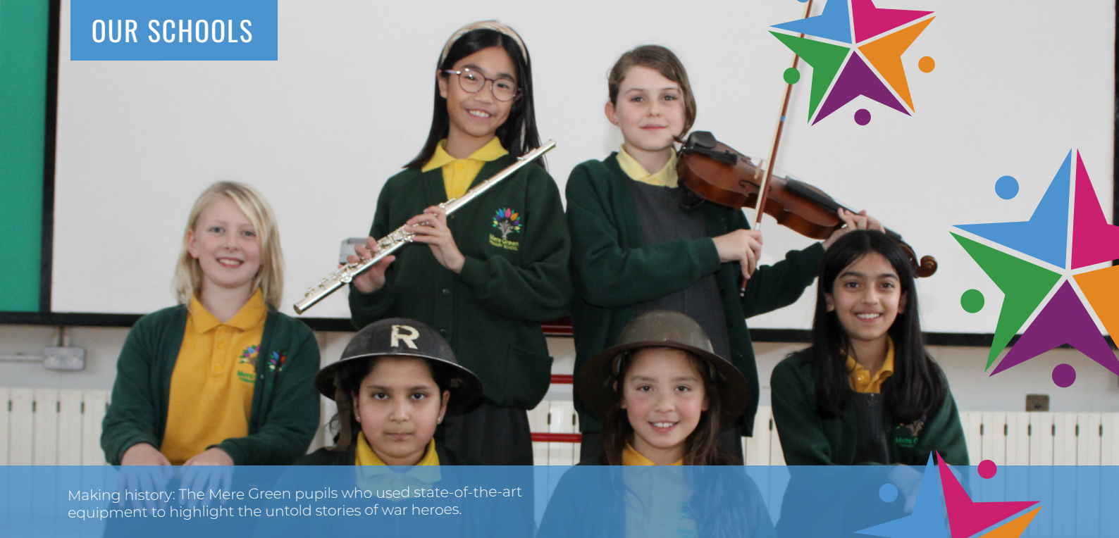
Making history: The Mere Green pupils who used state-of-the-art equipment to highlight the untold stories of war heroes.