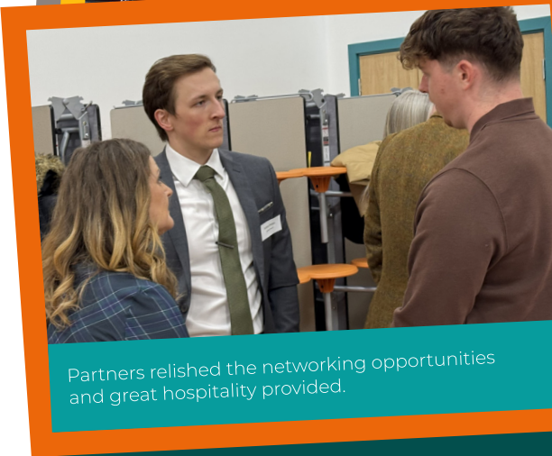
Partners relished the networking opportunities and great hospitality provided.