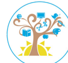
Osborne Primary School