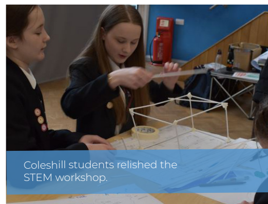
Coleshill students relished the STEM workshop.

The Smallpeice Trust is an educational charity that inspires young people to pursue careers in science and engineering through events and workshops.