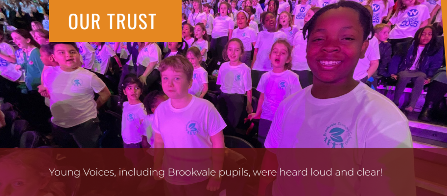
Young Voices, including Brookvale pupils, were heard loud and clear!