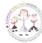
William MacGregor Primary School