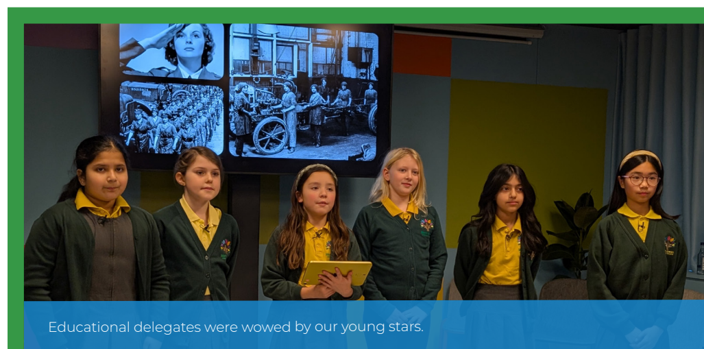
Educational delegates were wowed by our young stars.

“We are immensely proud of their achievements and the way they represented our school community on such a prestigious platform,” he said.