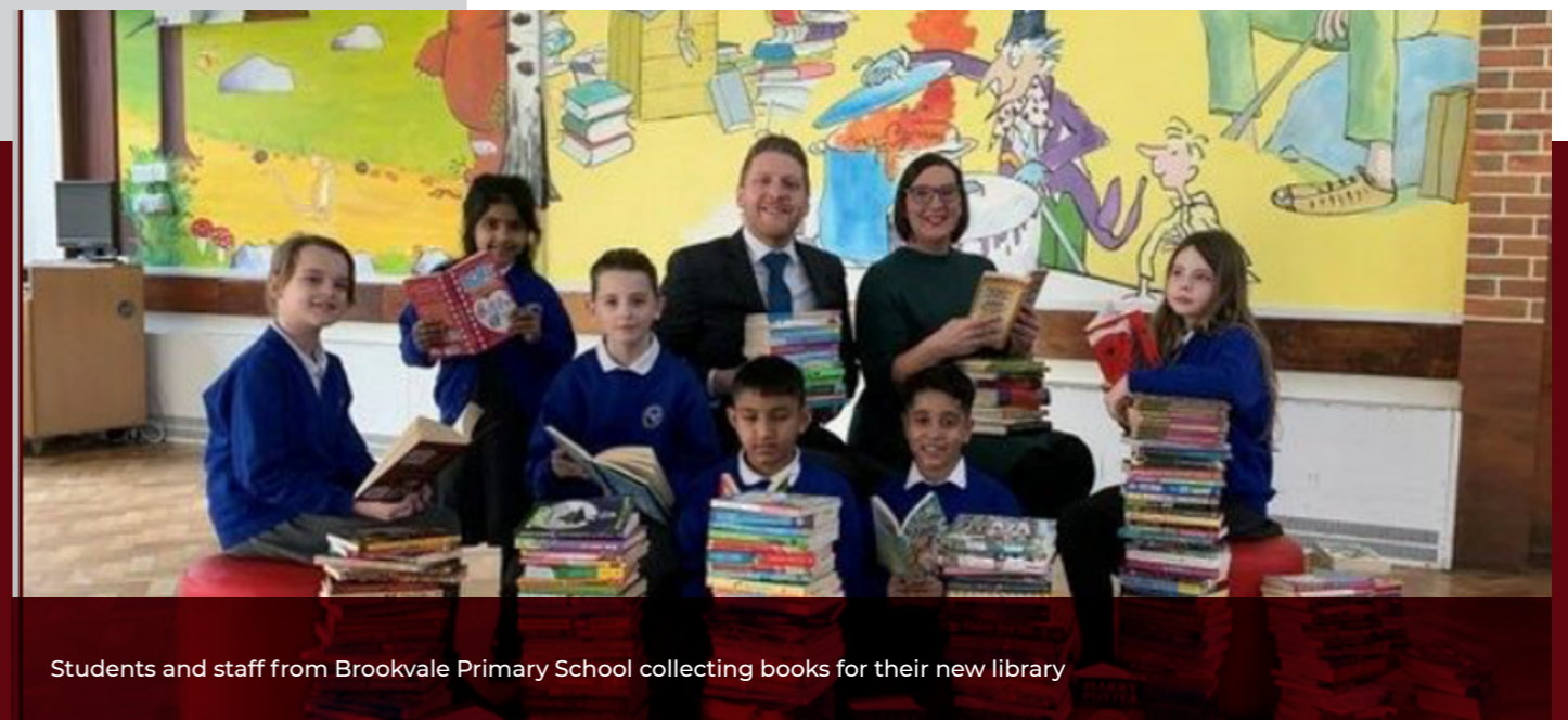
Students and staff from Brookvale Primary School collecting books for their new library